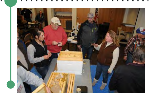
Local Bee Clubs