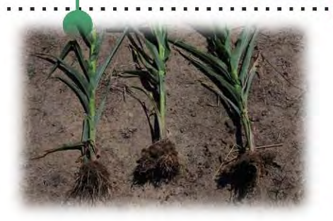
Working with Farmers on Crop Production Issues