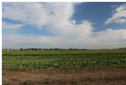
Letterly Property, purchased by City of Brighton in 2011