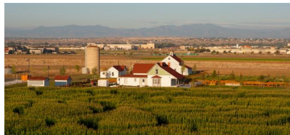
Bromley-Hishinuma Farm Property, purchased by City of Brighton in 2017