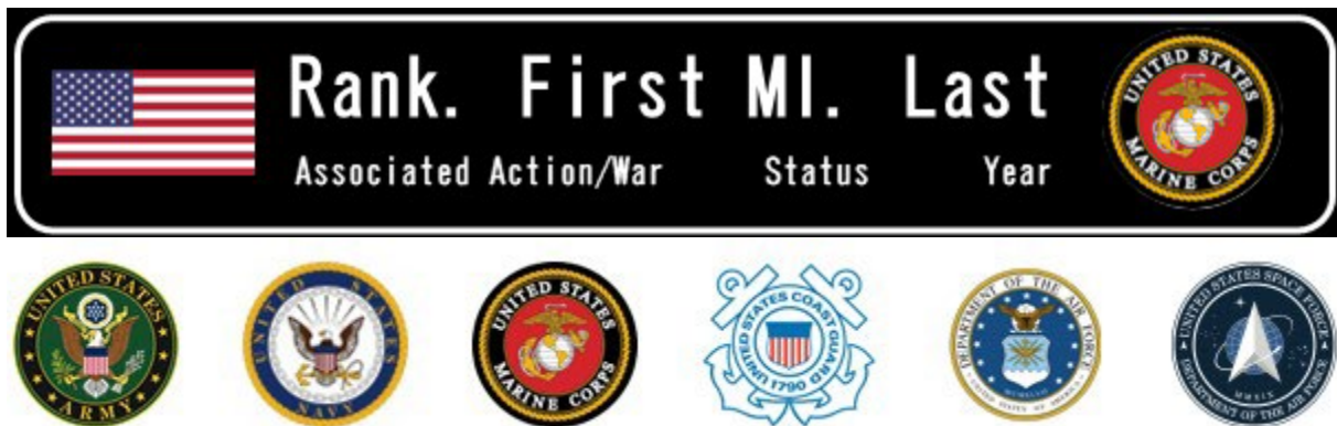
Figure 3 - Sign layout and armed forces branch authorized images

Figure 3 shows the placement of each element on a fully populated street name sign as well as the respective armed forces branch authorized images.