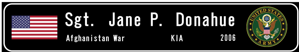
Figure 1 - Street Name Sign Sample Design

A sample of the street name sign design is shown in Figure 1 .