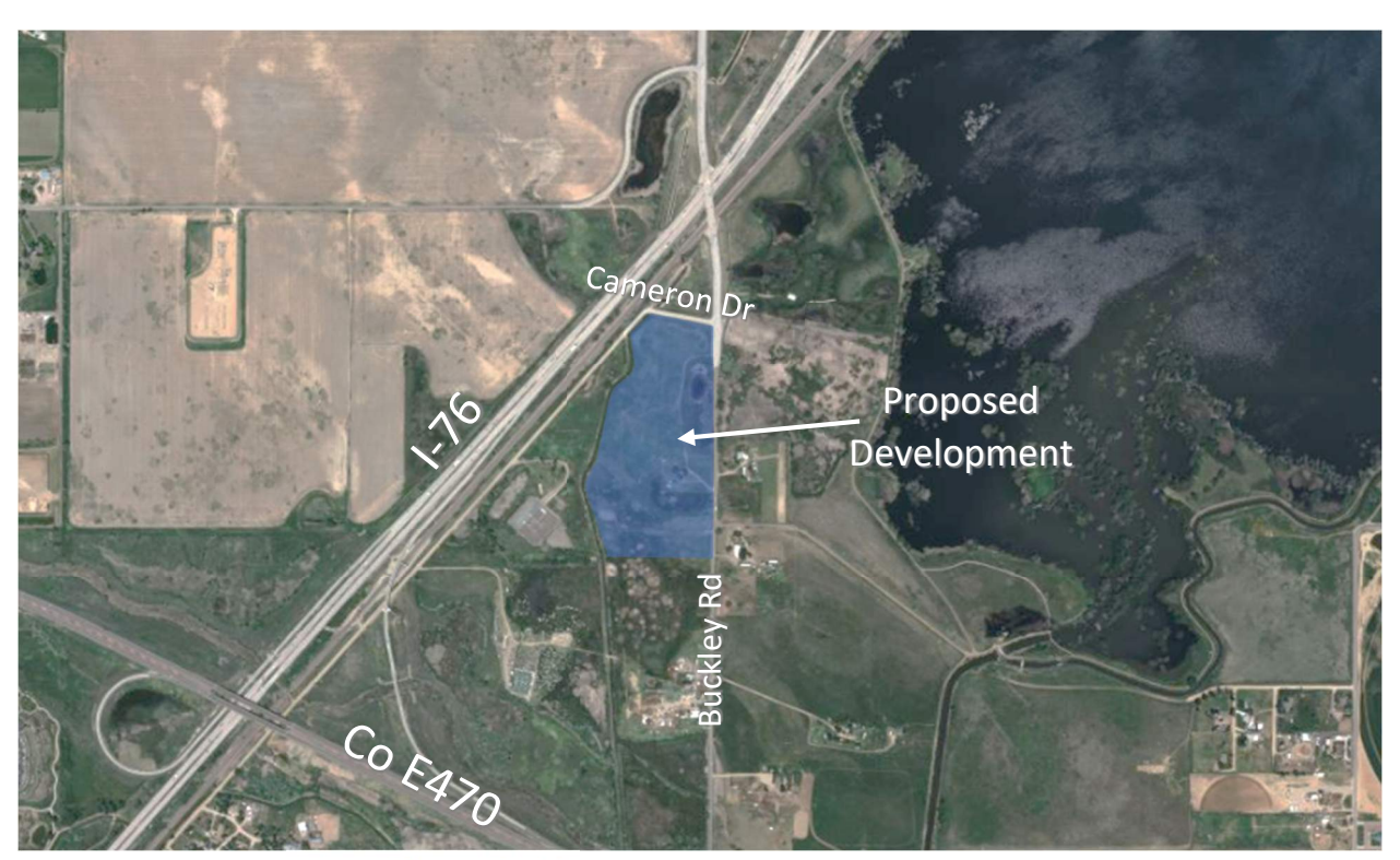
Figure 1 – Proposed Development Location

The proposed site is on approximately 41.3 acres located east of Buckley Road and south of Cameron Drive. The site is shown in Figure 1 below.