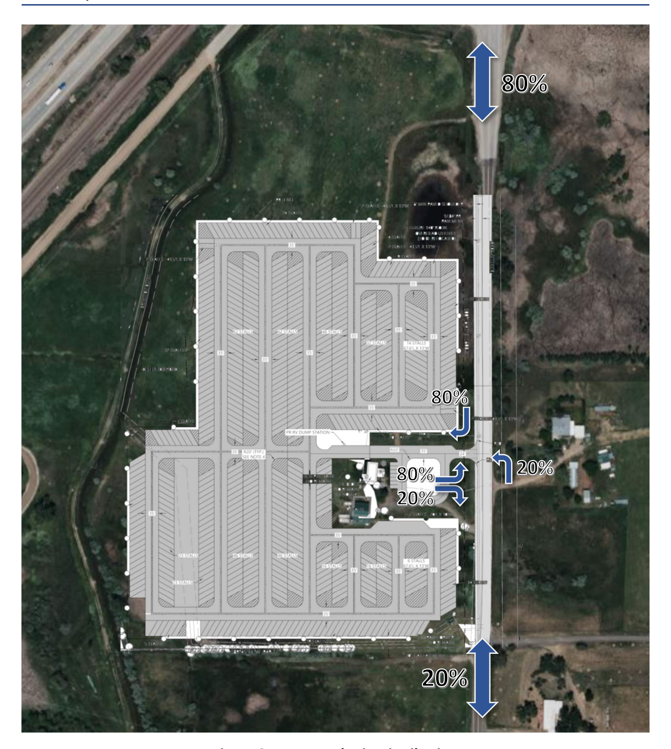
Figure 2 - Proposed Trip Distribution