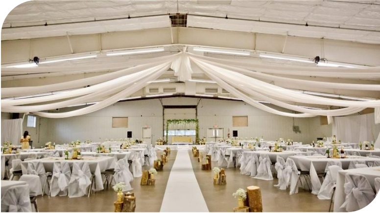
EXHIBIT HALL – 2025