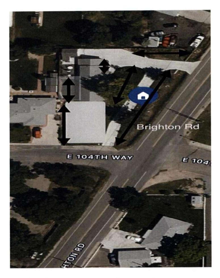
The black arrows are the landscape areas.

According to the Adams County website, my Lote size is 9,583 sqft, there would not be any changes to the landscape areas. The property has 10 existing trees of different kinds. The arrow between the designated area for CUP and the neighbor driveway there are some kind of small trees or bushes along the fence that are going to stay. The bigger arrow close to Brighton Rd has the most trees (7). The rest of the arrows have grass and trees. No trees or any landscape areas will be disturbed.