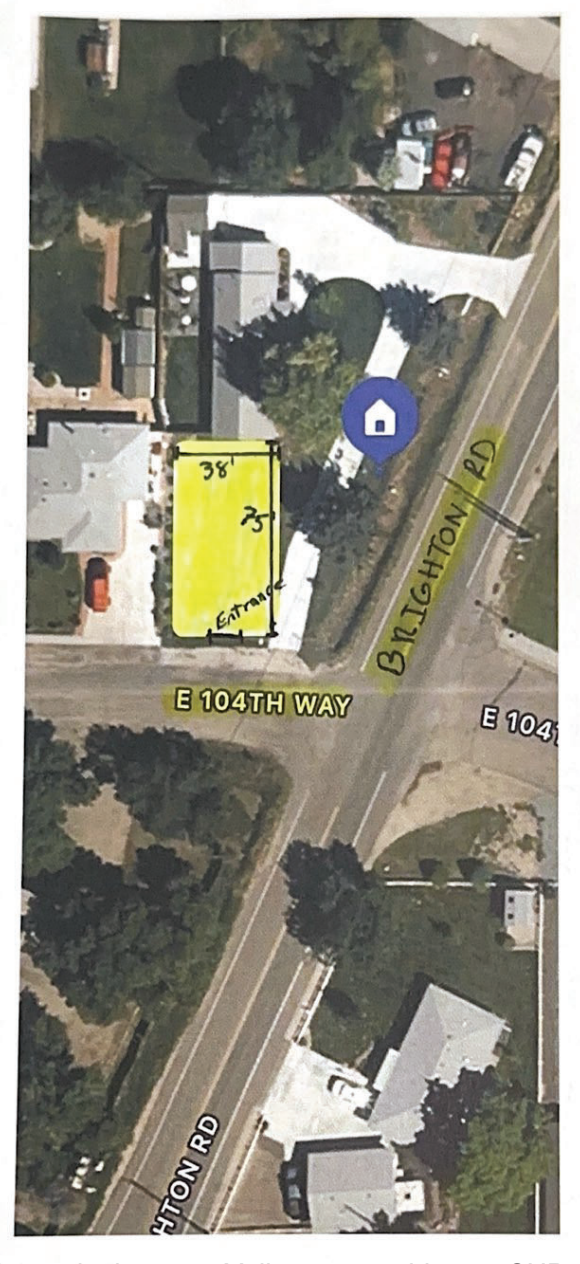
land uses in the area. Yellow area subject to CUP

The area is residential and is zoned R-1-C with portions being also zoned A (agricultural). surrounding uses are rural residential and agricultural. The proposed request will not alter the base zoning or land uses of the area.